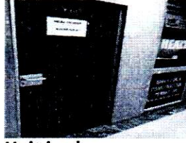
Unit in charge

Moon Star Building, Second Floor, Kingsway Road , Maseru 100 Tel: +266 2231 7386 Email: general@mcc.org.ls Website: http://www.mcc.org.ls/