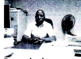
Person in charge

Mon: 08:00 - 12:45, 14:00 - 16:30 Tue: 08:00 - 12:45, 14:00 - 16:30 Wed: 08:00 - 12:45, 14:00 - 16:30 Thu: 08:00 - 12:45, 14:00 - 16:30 Fri: 08:00 - 12:45, 14:00 - 16:30