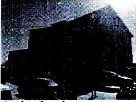
Entity in charge