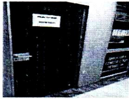
Unit in charge

Moon Star Building, Second Floor, Kingsway Road , Maseru 100 Tel: +266 2231 7386 Email: general@mcc.org.ls Website: http://www.mcc.org.ls/