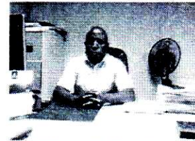
Person in charge

Mon: 08:00 - 12:45, 14:00 - 16:30 Tue: 08:00 - 12:45, 14:00 - 16:30 Wed: 08:00 - 12:45, 14:00 - 16:30 Thu: 08:00 - 12:45, 14:00 - 16:30 Fri: 08:00 - 12:45, 14:00 - 16:30